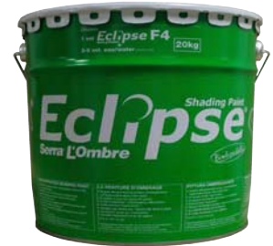
Net Weight 20 Kg

Eclipse ® is used to tint glass and plastic greenhouses for a season. It will regulate light intensity and humidity conditions for the perfect climate inside your greenhouse